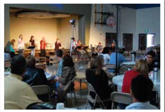
Lifesong's Grand Opening Service

Check out Lifesong Church: www.lifesongrr.com .