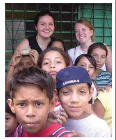
Short-term missionaries visit a school in Managua, Nicaragua.

Check out Linworth Road Church: www.linworthroad.org .