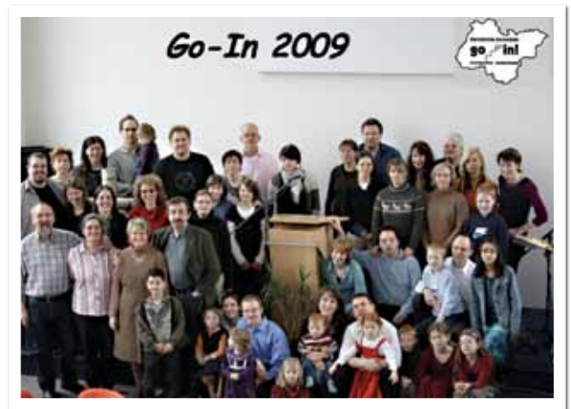
Gospel International in Dortmund, Germany