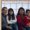
Reaching the Nepalese PAGE THREE