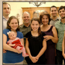
New Life Miami PAGE TWO