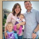
Church in Pamplona, Spain PAGE THREE