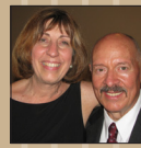
God's Work in Italy PAGE THREE