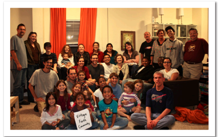
Vintage Faith Community Church

Many of the neighbors that we have met thus far do not regularly attend a church and most are not interested. We trust that by being an active example of Christ in our neighborhood, we can see communities of leaders band together to be "the church" to one another and to the city.