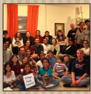
Planting a church Vintage Faith CC St. Petersburg, FL PAGE TWO