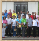
Teamwork in Action PAGE THREE