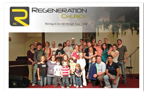
The Regeneration church plant team.

In October 2012, Regeneration Church held its first service in the New Life building. It was an exciting time. One of the first hurdles was filling all of the various needs to facilitate a service. Everyone quickly stepped up, taking on one or more roles. In the few months we have been meeting, we have seen encouraging spiritual growth in our saints, and 6 baptisms.