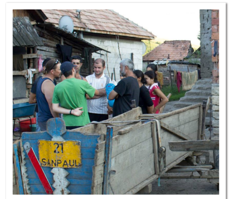
Outreach in a Romanian village.