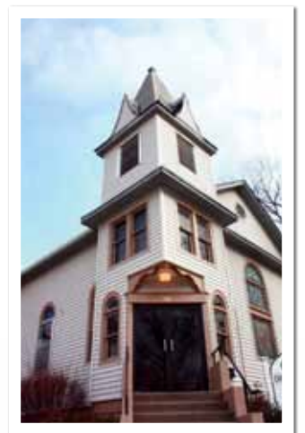
The new home of Vintage Faith

He replied, “Yeah, how’d you know?” A tear rolled down his cheek. People need the Lord.