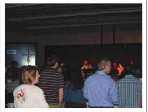
Worship at the new River Ridge location

Also, fellow GCC church Grace Point Community Church graciously donated a trailer and supplies for storing