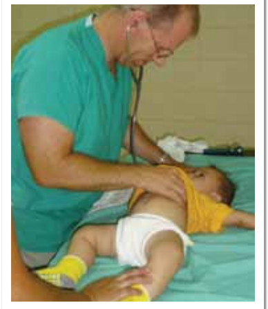
An infant receives care at the Total Health clinic.