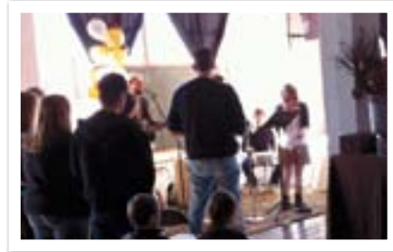
A Crossroads church service.

Our prayer is that as we enjoy life with