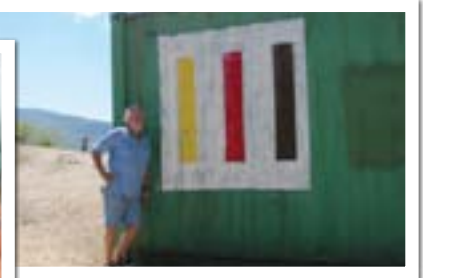
Left: A Lakeville missionary with children from Venezuela. Right: A missionary stands with a shipping container filled with meals packed by The Urban Refuge.

Overall, the Evergreen churches have been incredible examples in making financial sacrifices to support missionaries and ministries all over the world, and in sending men and women to labor for the gospel.