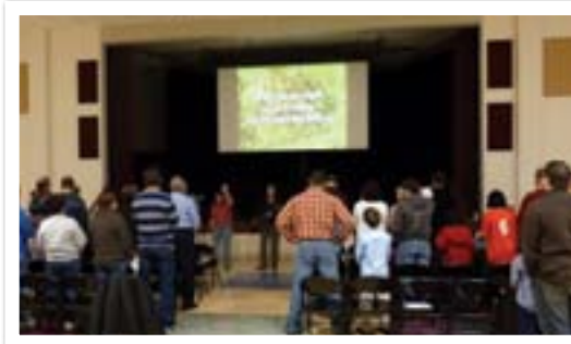
Grace Harbor's church service.

Our church was founded on seeking direction from God through prayer and scripture. We recently completed 21 days of prayer and fasting as a church, focusing on "hearing God's voice and aligning our lives with God." What a blessing to draw near to God and heighten our sensitivity to His Spirit. In addition, our discipleship process