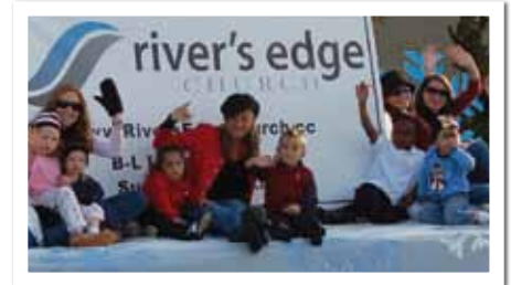
Members of River's Edge on their Christmas float.

We launched our first Sunday service this past March. Our vision is that, through River's Edge, God would change this city; that people of all ethnic backgrounds and anyone who does not fit in at