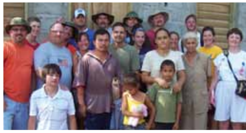
A short-term mission team with a local family.

Members of Grace Point have started Total Health, a non-profit medical relief