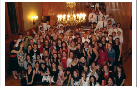
The Rock at an outreach event.