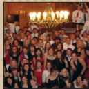
Candlewood Campus Ministry PAGE TWO