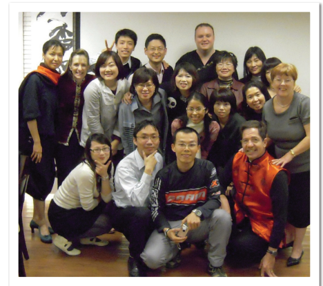
The team in Taiwan.