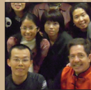
A Heart for Taiwan PAGE THREE