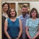
Mission to Monterrey PAGE THREE